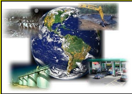
Engineers touch nearly everything we use. They evaluate aspects such as product safety, functional-

East Mecklenburg is one of five High Schools in North Carolina that qualified for and launched an Academy of Engineering program. Over 20 Students were accepted into the program which began in the Fall of 2011. The program has been carefully designed to introduce students to a wide variety of engineering principles PLTW classes for the program including Introduction of Engineering Design, Principles of Engineering, Civil Engineering & Architecture, Biotechnical Engineering, and Engineering Design and Development are four foundation classes.